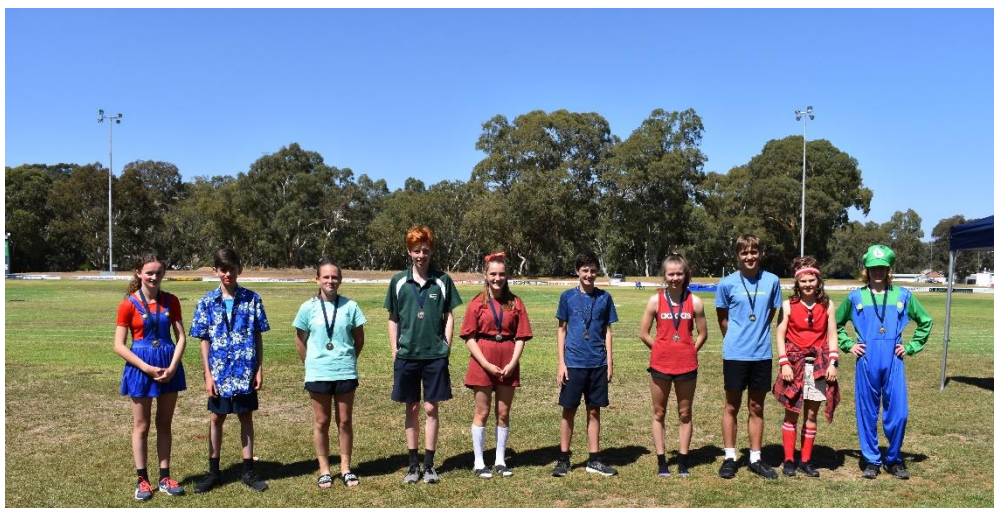
AGE GROUP CHAMPIONS