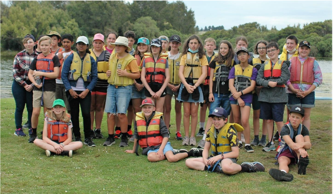
YEAR 7 GROUP